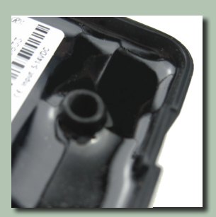
Resin filled for all weather installations