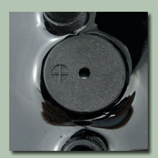
Externally controlled built-in piezo sounder